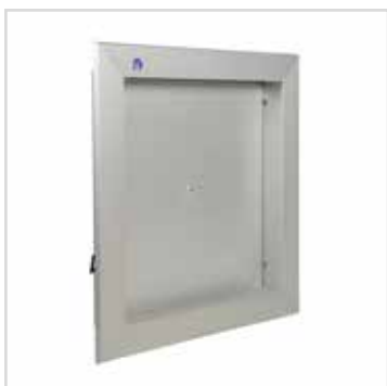
Cable feed channel