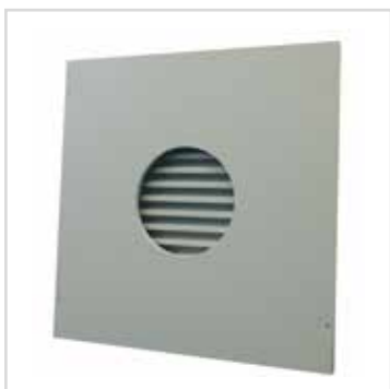
411 with thermal insulation panel